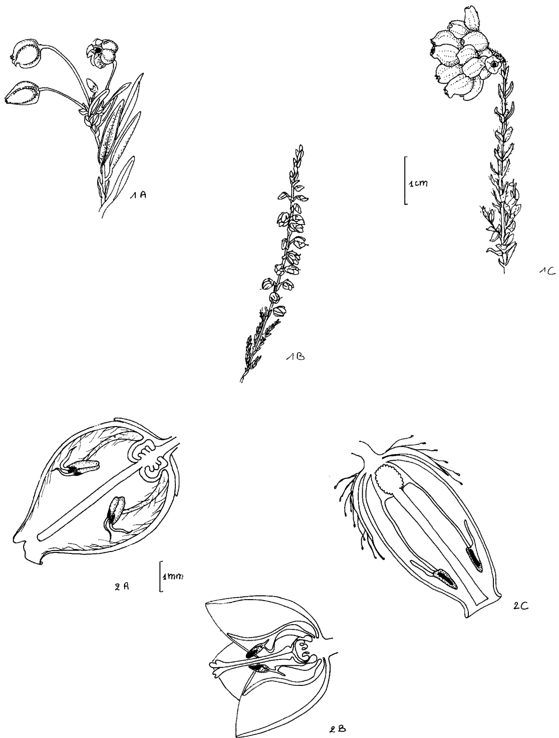
FIG. 1. — Inflorescence (1) and cross-sections of flowers (2) of the 'capsule' Ericaceae species. (A) : Andromeda polifolia , (B) : Calluna vulgaris and (C) : Erica tetralix .