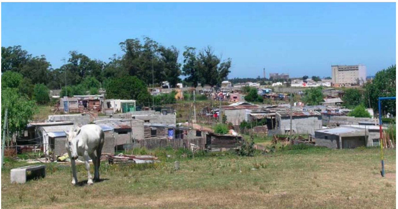
A precarious squatter settlement in Montevideo that grew on the fringes of an earlier planned occupation.