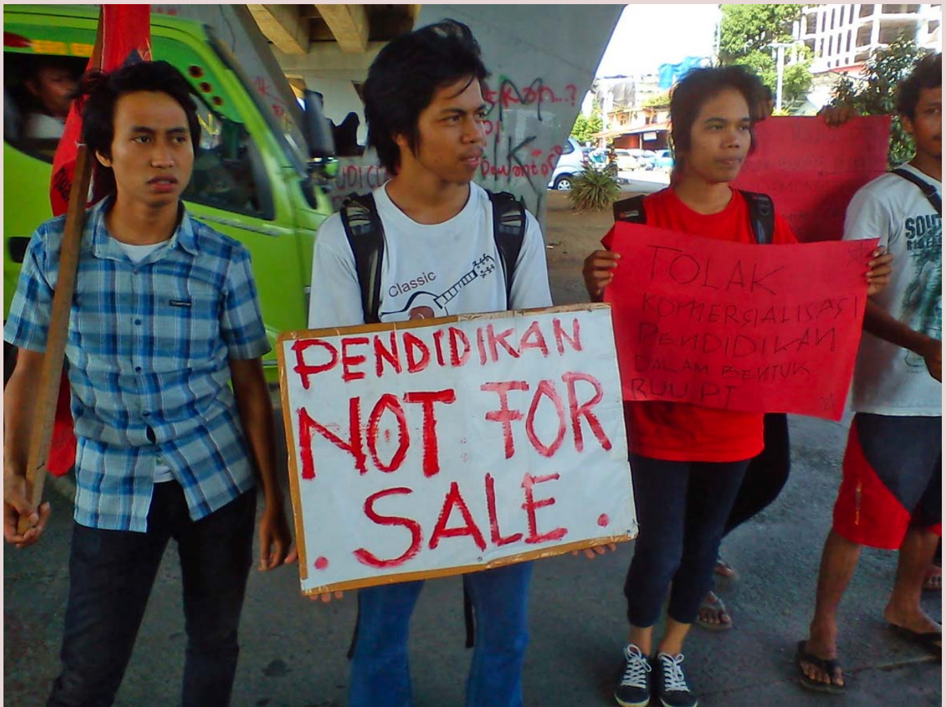
Students in Jakarta protest against neoliberal regulation of education.