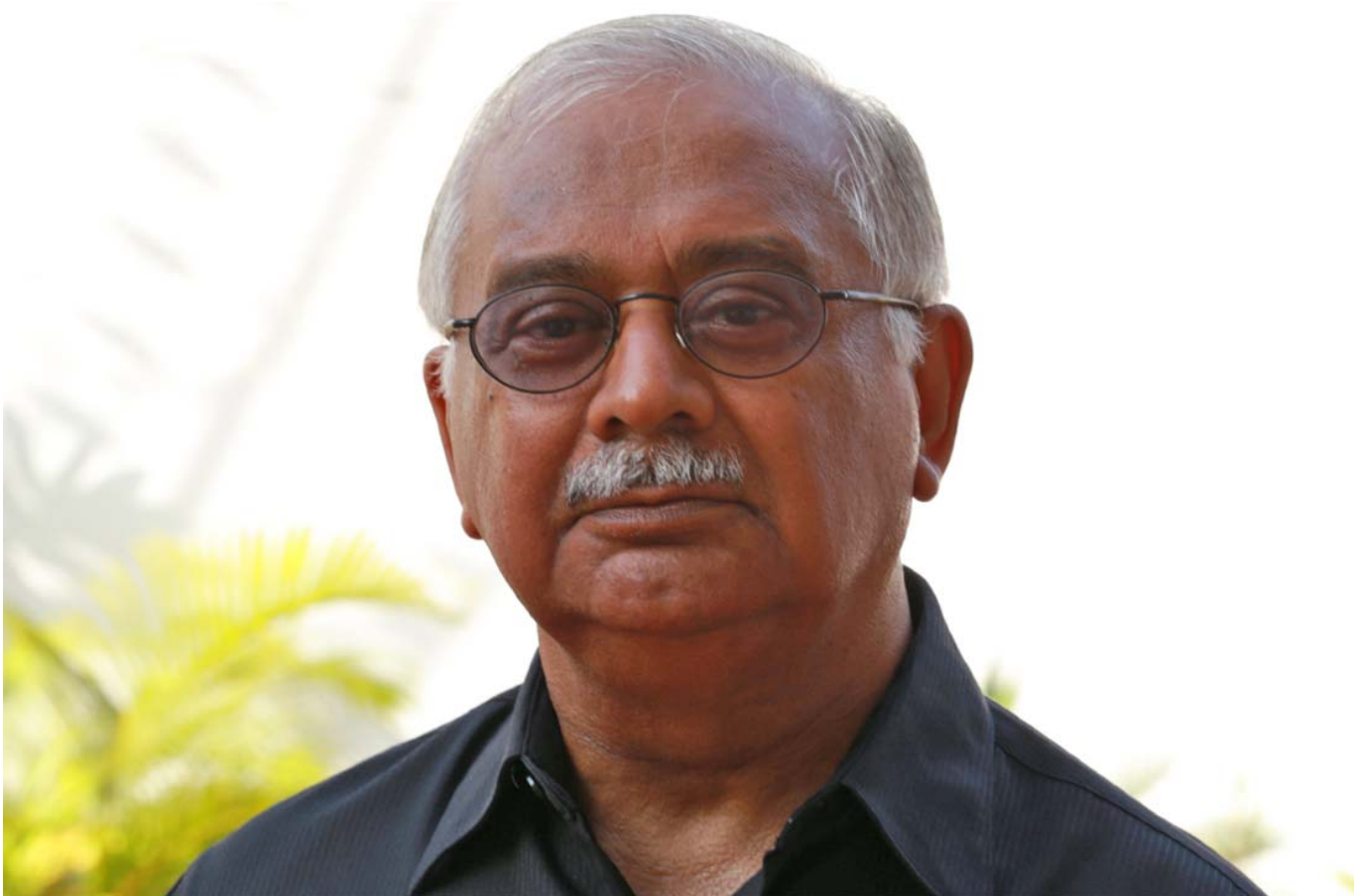
| Issa Shivji.