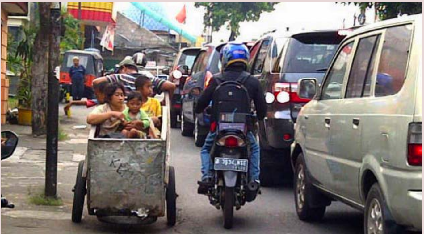
Social stratification in a busy road of Jakarta.