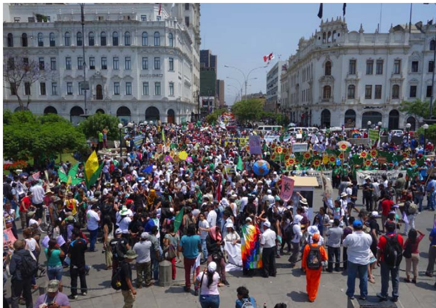
People from across the political spectrum flooded downtown Lima in one of the most militant international climate change demonstrations in years.

tions. For all their bitter fights against their developed-country counterparts in the negotiations, many ruling elites from the South ultimately share the goal: to transform the system so as to keep it fundamentally unchanged.