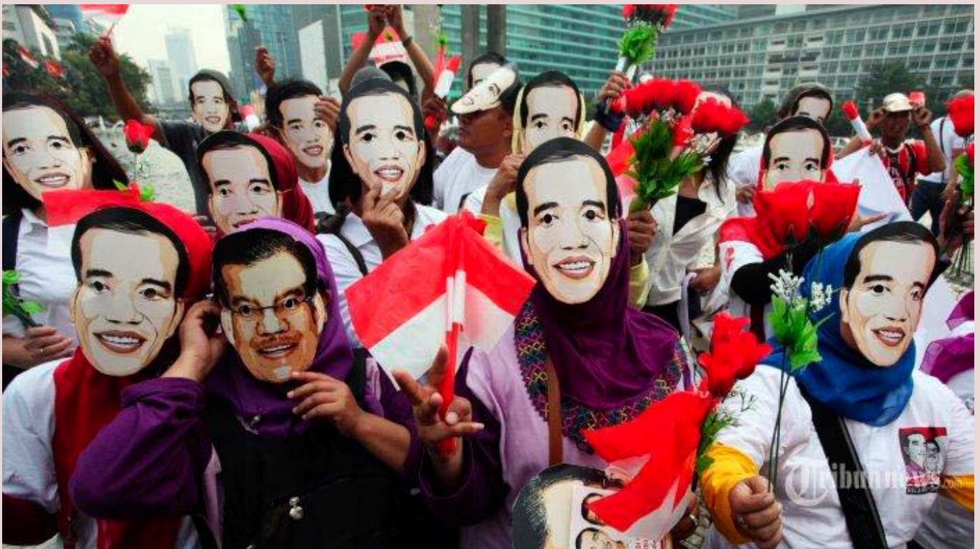
Supporters of the presidential team of Joko Widodo and Jusuf Kalla organize their campaign in Jakarta.