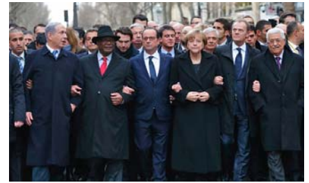
Boaventura de Sousa Santos , world-renowned Portuguese sociologist and legal scholar, takes a global perspective on the assassinations of Charlie Hebdo cartoonists.