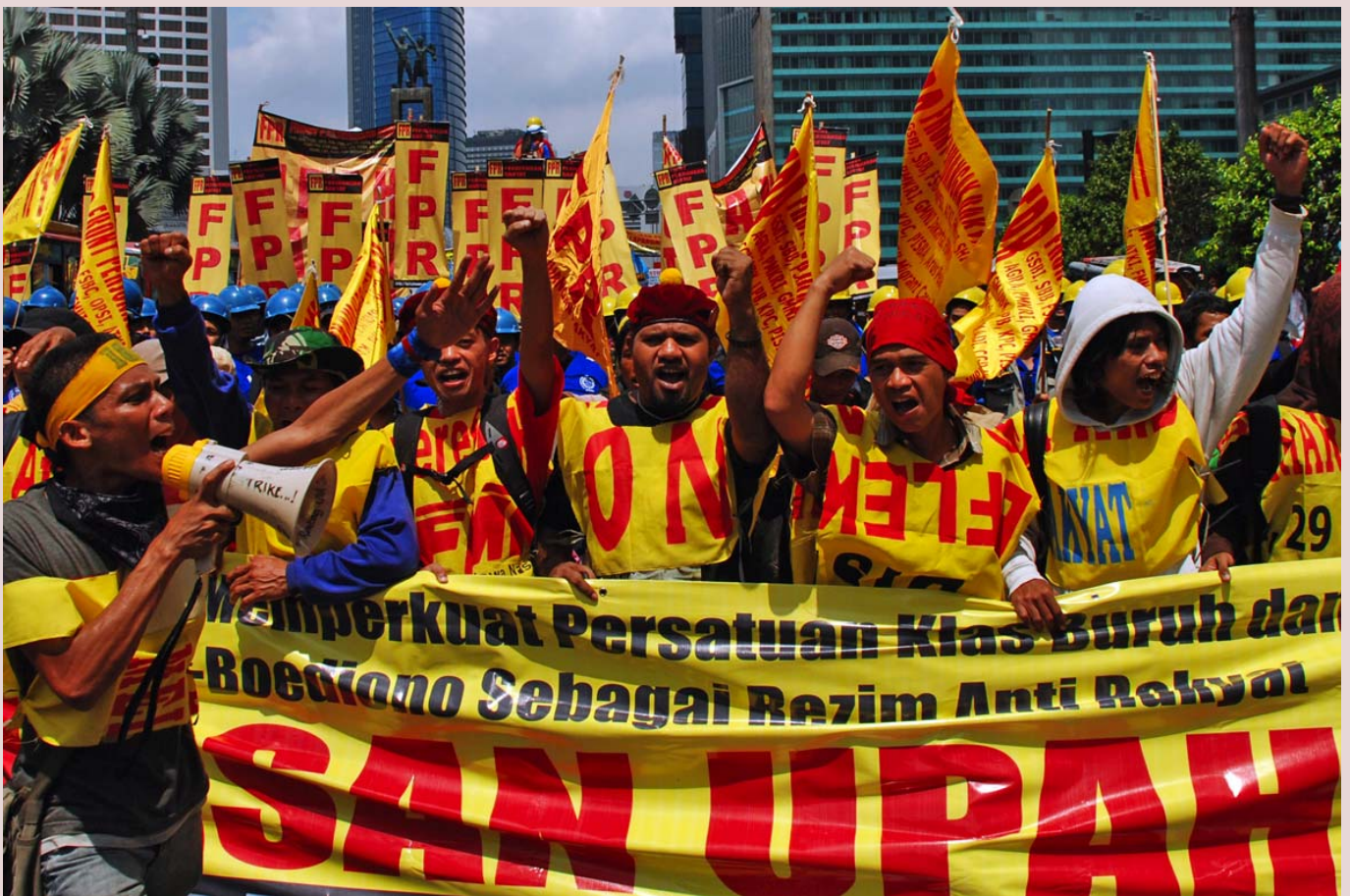
Workers demonstrating on May Day in Jakarta, calling for working class solidarity.