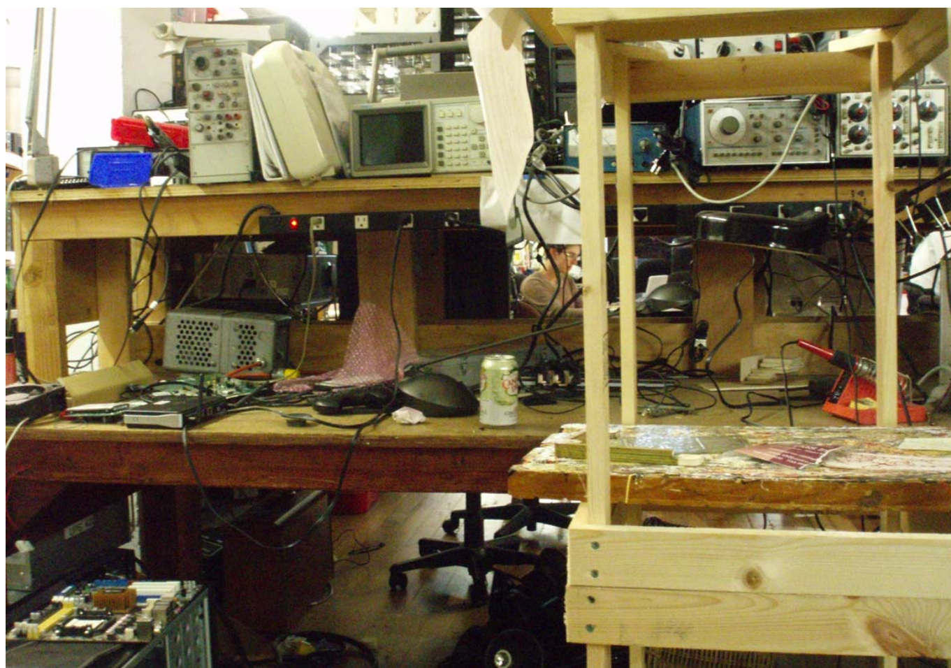
A typical hackerspace.