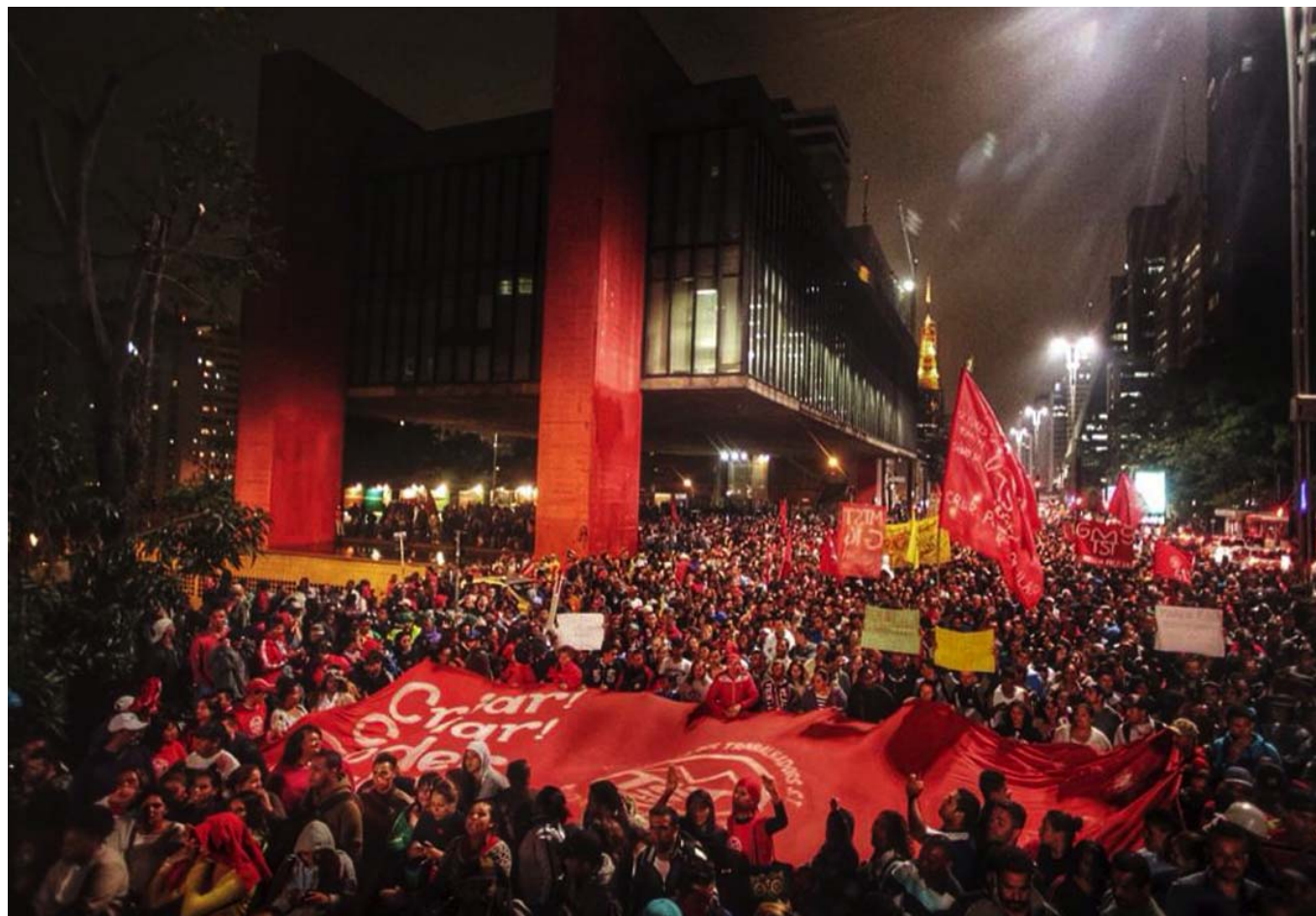
March of MTST at Paulista Avenue, downtown São Paulo, demanding "More popular reforms, more rights."