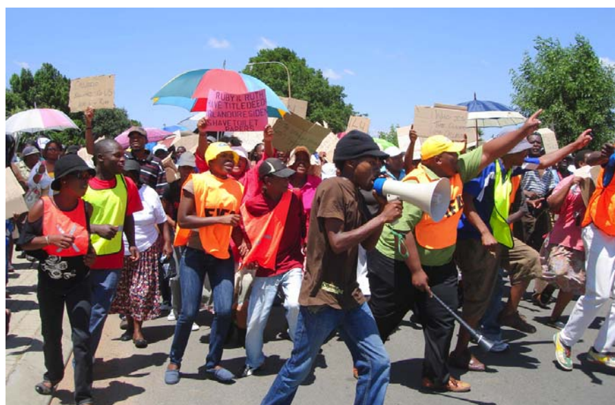
Orlando residents in Soweto protest their community's exclusion from construction projects before the 2010 World Cup.