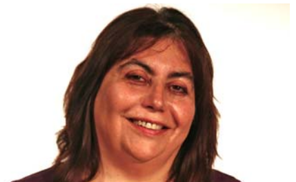
Nira Yuval-Davis , distinguished sociologist of gender and human rights has an internal conversation with famous Israeli sociologist Baruch Kimmerling about the different roads to public sociology.