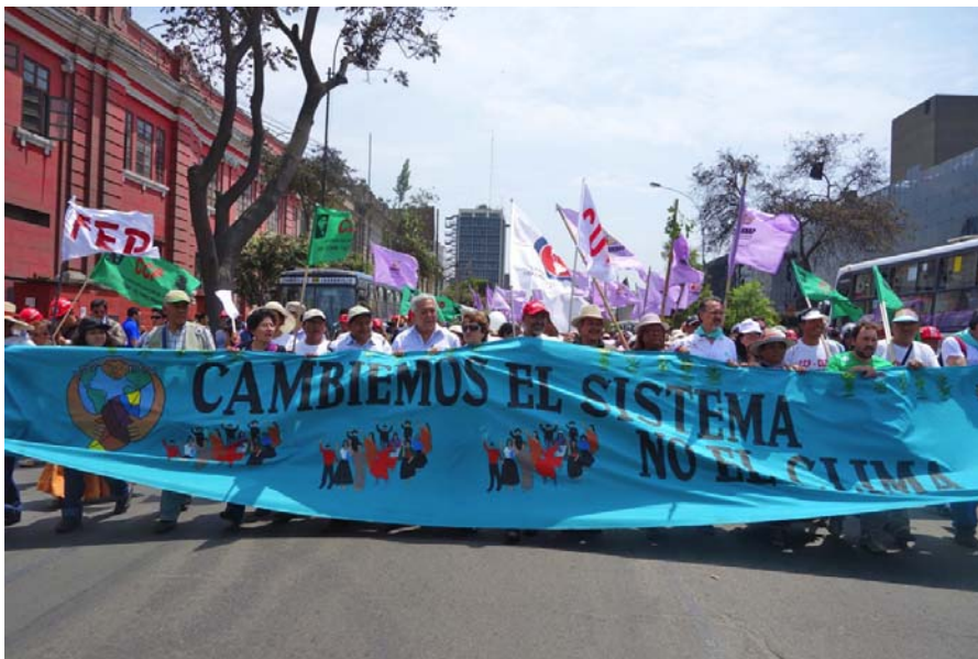
The People's March to Defend Mother Nature during the UN climate change summit in Lima, led by social movements from around the world demanding "Change the System not the Climate."