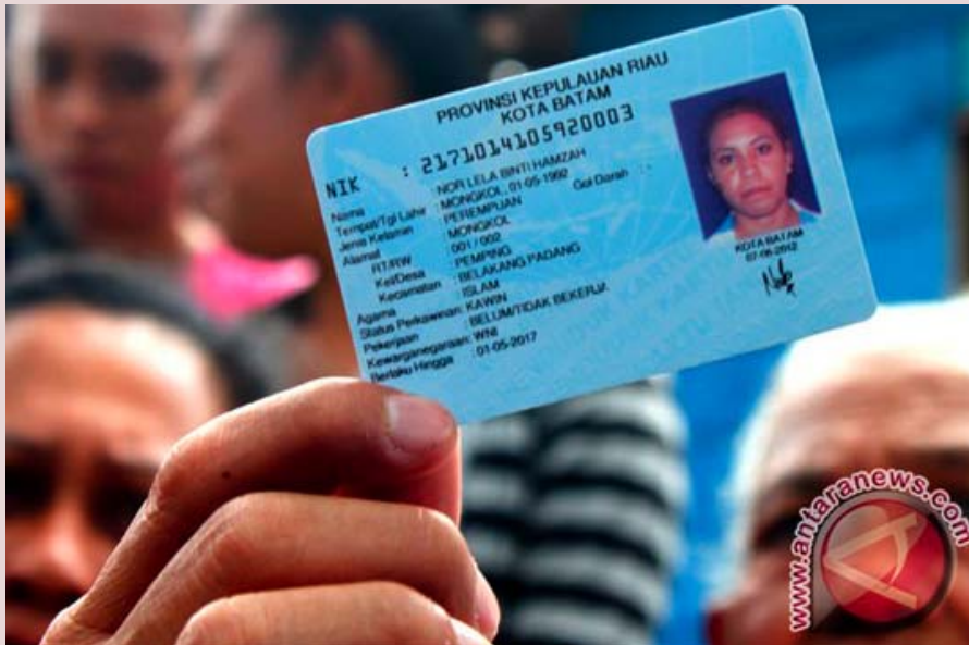
The Indonesian Identity Card which includes religious identification.