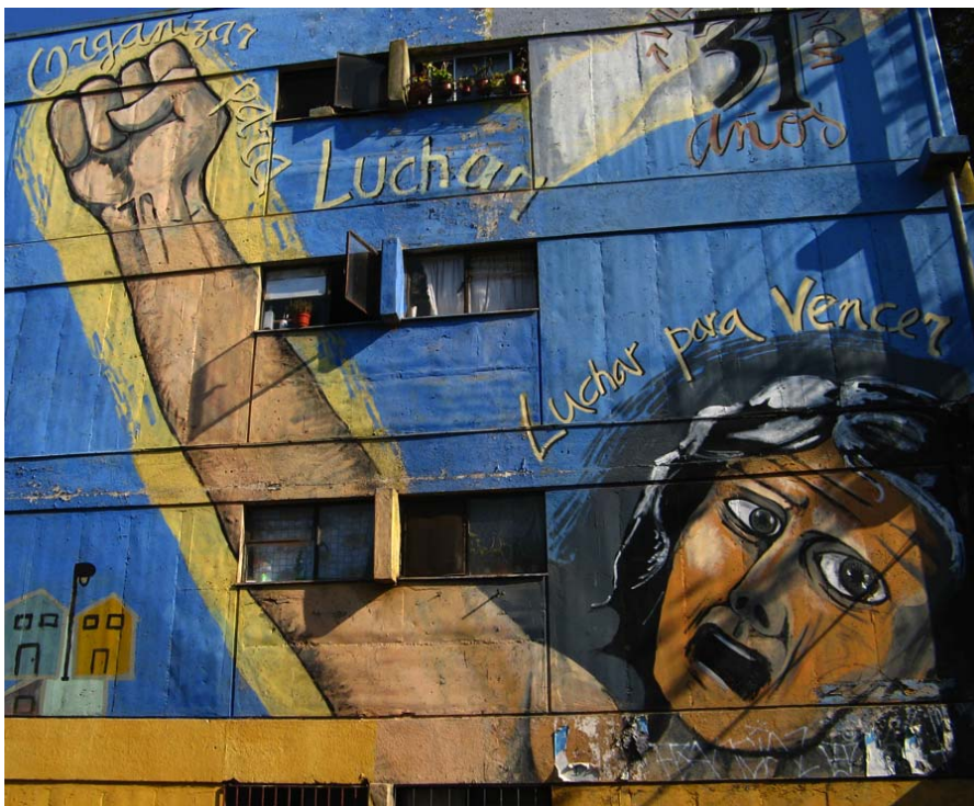
A mural in Villa Francia, one of Santiago's contentious neighborhoods, exhorts residents to "Organize for struggle, struggle to win."